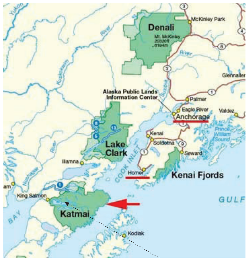
● Brooks Camp, Brooks Falls in Katmai